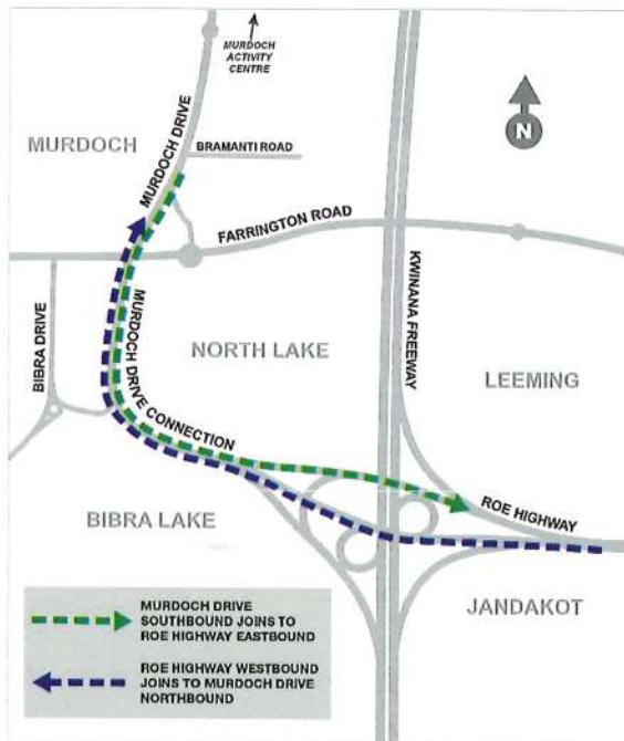
New access to/from the Murdoch Activity Centre and Roe Highway